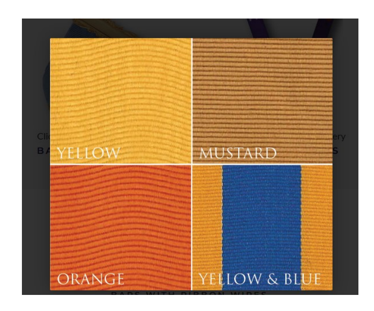
The Council colours of yellow and blue are suggested

Single mitred neck ribbon £50.45/each (single thickness of ribbon)